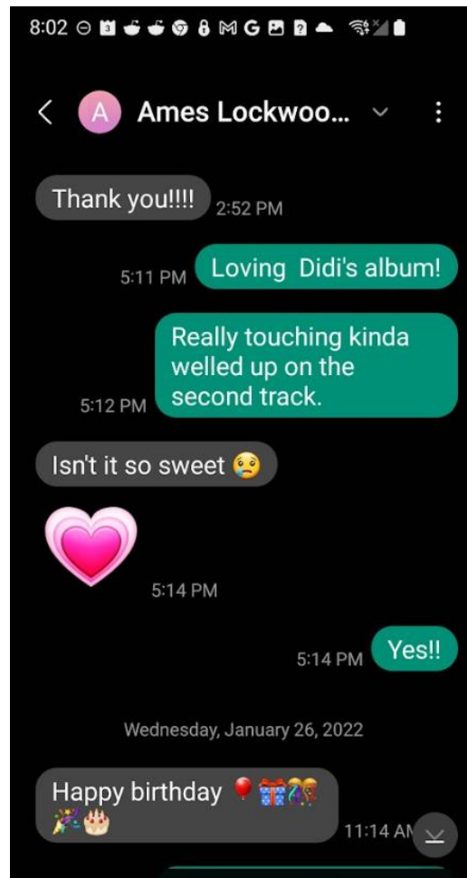
Exhibit B-16— Informal text exchanges between Plaintiff and Nissen (January 26, 2022) showing ongoing friendly rapport, contradicting later claims that Plaintiff's involvement was unwanted. -----