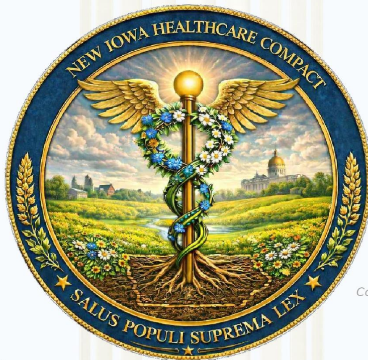
Concept Art for Official Seal

A two-tiered plan built for Iowa's economy and civic values: