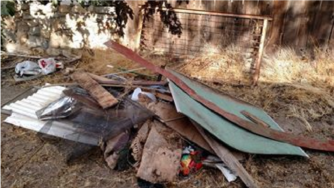
9-1-2015: Began removing garbage from both houses.

We removed garbage from inside both buildings and from around the yard: