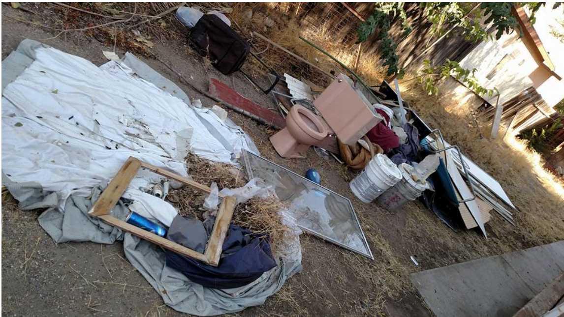
9-5-2015: Garbage and recyclables gathered and removed from premises.